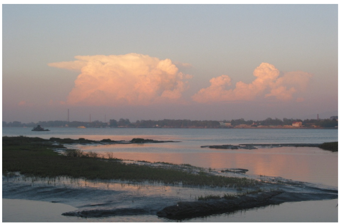
Hundreds of thousands of shorebirds and other waterbirds migrate through the Yalü Jiang Estuary (CN062), a wetland on the border of mainland China and North Korea.

Key: ● = Protected; ○ = Partially protected; ○ = Unprotected.